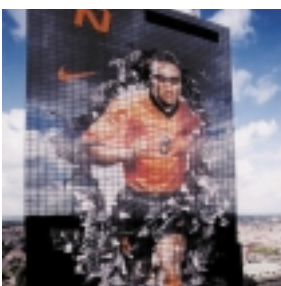
5 EuPC PVC Coated fabrics sector group